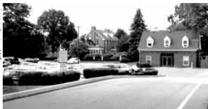
NEW COURTLAND ELDER SERVICE, 6959 GERMANTOWN AVE., IS THE NEW RECYCLING SITE (ENTER ON CARPENTER LANE).

As of October 21, Weavers Way Co-op has a new recycling site. We shall no longer be using the rear entrance of the Unitarian Church at 6511 Lincoln Drive.