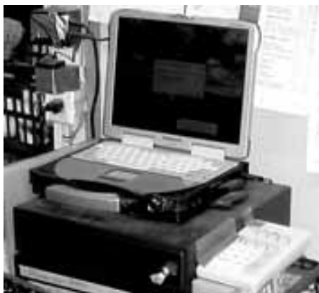
THE NORMTRONIC 9000 A spine tingling tale of cramped quarters, busy Sunday afternoons, and random social gatherings, at a Co-op near you...

You asked for it, here it is. We have added a fifth register — a small laptop — at the front of the line. It will aid in our busiest days, and speed you through the line in record time (well, maybe not record time, but it sounded good).